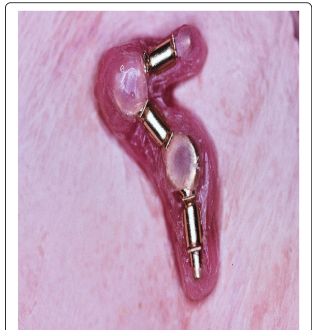
Fig. 9 Retention clips blocked out on the bar

The patient was instructed in home care, and a recall system was set up. He was followed up annually for 3 years prior to moving away. Mild erythema and buildup of sebum were noted at the first recall which was