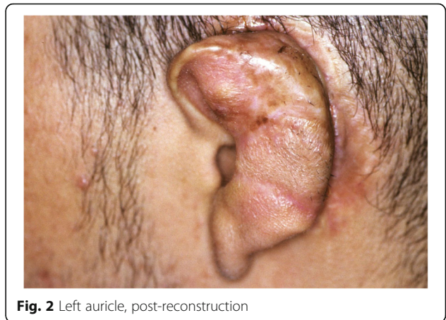
Fig. 2 Left auricle, post-reconstruction

An alternative approach to the treatment of microtia has been to use a prosthetic material to replace the missing or malformed portions of the ear. The use of artificial prostheses to restore facial structures has been recorded since ancient times [11], and the use of leather, fabrics, clay, and metal as prosthetic materials and retention mechanisms have all been reported [12]. The improvement in dental materials in the twentieth century allowed for increasingly realistic prosthetics; however, many of the newer materials did not possess the durability required of a long-term prosthetic restoration, nor a reliable method to attach it to a defect. The evolution of advanced silicone elastomers and the introduction of osseointegrated craniofacial implants [13] as a method