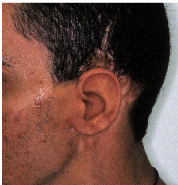
Fig. 11 Lateral view of the completed prosthesis