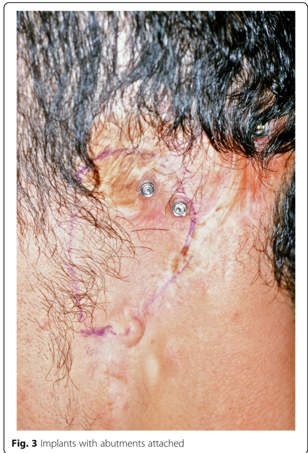
Fig. 3 Implants with abutments attached