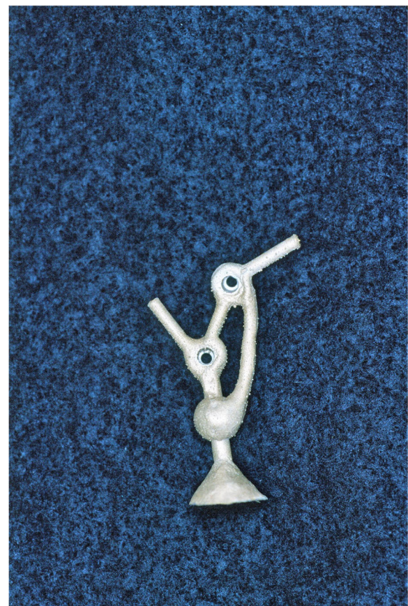
Fig. 7 Retention bar cast in type III gold alloy