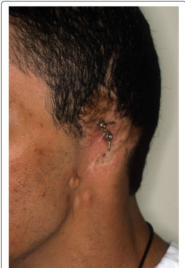
Fig. 8 Bar framework attached to implants

eliminated with improved hygiene of the area using a soft bristle brush and 3% hydrogen peroxide. The issue was evaluated by visual and tactile examination. No evidence of swelling, bleeding, or suppuration was noted. The prosthesis was remade at 18 months due to the deterioration of the silicone flap. No complications were noted with the implants, abutments, or bar and clip framework. The tissue reaction and remake rates are similar to published studies [18].