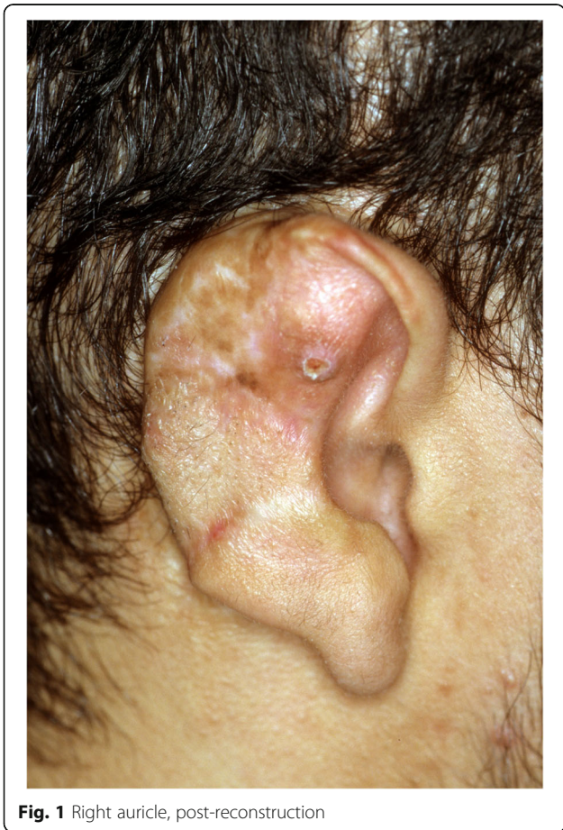
Fig. 1 Right auricle, post-reconstruction

The use of craniofacial prosthetics for the rehabilitation of microtia often results in superior esthetic results