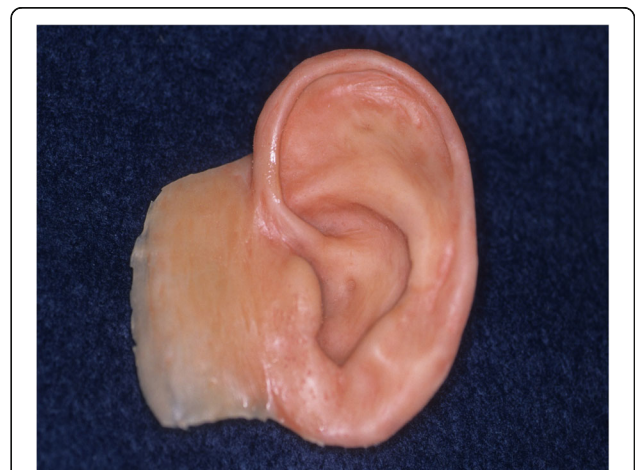
Fig. 10 Processed intrinsically colored prosthesis with tissue flange

eliminated with improved hygiene of the area using a soft bristle brush and 3% hydrogen peroxide. The issue was evaluated by visual and tactile examination. No evidence of swelling, bleeding, or suppuration was noted. The prosthesis was remade at 18 months due to the deterioration of the silicone flap. No complications were noted with the implants, abutments, or bar and clip framework. The tissue reaction and remake rates are similar to published studies [18].