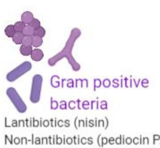
Figure 3 summarizes the main types of bacteriocins produced by Gram-positive and Gram-negative bacteria.

Non-lantibiotics (pediocin PA-1) Large peptides (megacin A-216) Complex peptides (enterocin)