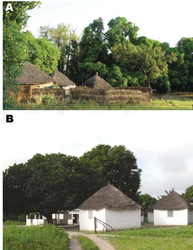
Figure. A) Dielmo village in Senegal. B) Health and clinical research station in Dielmo, where a longitudinal prospective study for long-term investigation of host–parasite associations has been conducted since 1990.

B. crocidurae accounts for high fever, frequent neurologic complications (10), and up to 9 recurrences over several months, but the mortality rates and early delivery by pregnant women caused by B. crocidurae seem to be lower than those caused by B. duttonii (3). In addition to