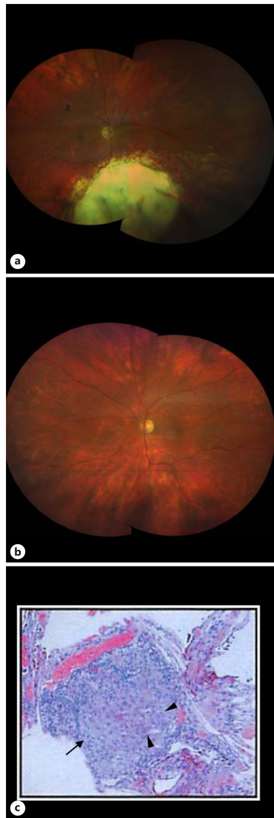
Fig. 2. Compilation of clinical images. a, b Posttreatment fundus photos of the biopsied right eye ( a ) and left eye ( b ) showing resolving chorioretinal lesions bilaterally. c Chorioretinal biopsy showing noncaseating granuloma (arrow) with multinucleated giant cells (arrowheads) with hematoxylin and eosin.