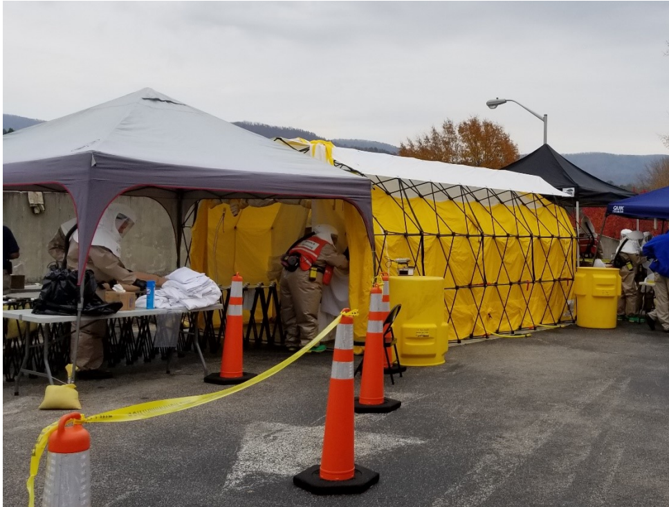
Figure 2. Hospital Decontamination Zone. In a mass-casualty chemical incident, a decontamination corridor is often used to rapidly clean and move patients through the hospital decontamination zone. Photo by Gregory Wanner, at Hospital Emergency Response Training in Anniston, AL.

Regarding personal protective equipment (PPE), hazardous materials responders at the scene (“hot zone”) of an unknown type of chemical release are often outfitted in Level A (fully encapsulating suit with self-contained breathing apparatus [SCBA]) or Level B (chemical resistant suit with SCBA) equipment. 11,31–33 This high level of respiratory protection, however, is not necessary for hospital-based first-receivers working in the potentially contaminated “hospital decontamination zone” away from the site of a release. 1,11 A time lapse of at least 10 minutes between a patient’s exposure and hospital arrival allows for “substantial levels of gases and vapors from volatile substances to dissipate.” 1,18 For this reason, Level C PPE, consisting of an air-purifying respirator (APR) or powered air-purifying respirator (PAPR) with appropriate filter cartridge, and a chemical-resistant suit with two layers of chemical resistant gloves, are recommended for first-receivers in a hospital decontamination zone (see Figure 3). Level D PPE (work uniform and everyday PPE) may be used for non-hazardous “nuisance” contamination or in handling clean patients after decontamination in the uncontaminated “post-decontamination zone.” 1,11,31–33