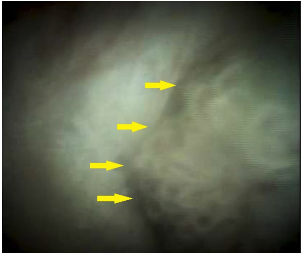
FIGURE 3: Cholangioscopy demonstrating a mucin-producing mass

Cold forceps biopsies performed during cholangioscopy showed columnar mucosa with adenomatous changes. The patient underwent a laparoscopic converted to open right hepatectomy. Pathologic examination revealed an intraductal papillary neoplasm, intestinal type, with focal high-grade dysplasia. The patient did remarkably well and had normal liver function tests and an abdominal ultrasound with no evidence of recurrence at a six-month follow-up.