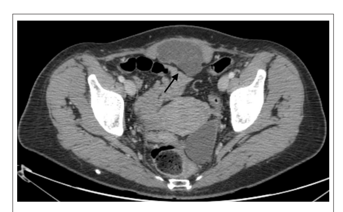
FIGURE 1 A solid, poorly vascularized mass, measuring 83 \times 63 \times 36 mm, with thin septa, is apparent in the rectus muscle of the abdomen in the suprapubic area (arrow).