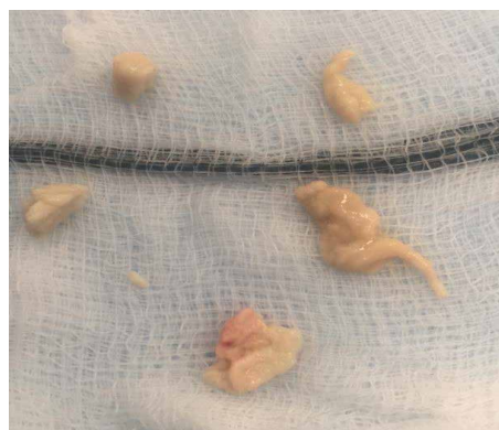
FIGURE 3: Retrieved fluffy fungal tissues by basket.

the placement of ureteral access sheath, 200 mls of pure pus was drained and sent for culture. A Zero Tip Nitinol Stone Retrieval Basket was then used to remove the fluffy fungal tissues and a JJ stent was left in place (Figures 2 and 3).