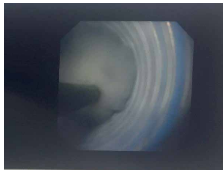
FIGURE 2: Fungal tissue inside basket within the ureteral access sheath.

The patient underwent an urgent cystoscopy and replacement of blocked JJ stent initially following which the patient's general condition as well as renal function improved (Cr 2.2 mg/dl). During the same admission he subsequently had a right sided flexible ureteroscopy which went as follows. After