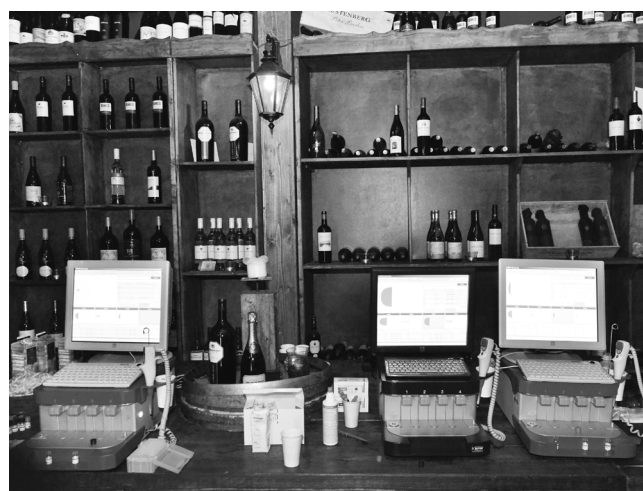
Fig. 1. Point-of-care setup for our study at the department’s Christmas party.

Three blood samples were taken from a cubital vein. Butterfly cannulas (Safety-Multifly-Set®, Sarstedt, Inc., Germany) and several test tubes (S-Monovette® and Citrat-Monovette®, Sarstedt,