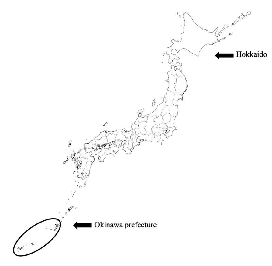
Figure 1. Hokkaido and Okinawa prefectures, Japan.