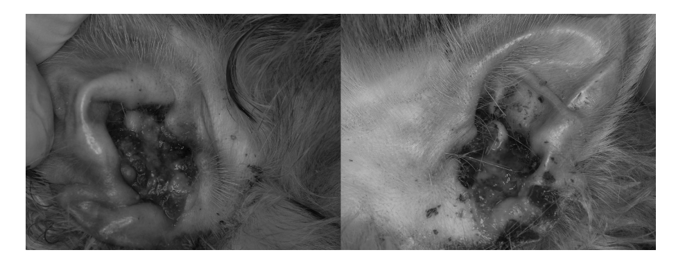
Fig. 1. Lesions of both ears at the initial visit.