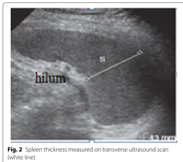
Fig. 2 Spleen thickness measured on transverse ultrasound scan (white line)

was measured on the transverse plane from the posterior margin to the anterior margin [18] (Fig. 2). The volume was calculated using the ellipsoid formula during the analysis [29, 30]. The spleen dimensions were measured three times and recorded on the checklist then the average value was taken during analysis [31]. Finally, the baselines data including age and sex were recorded for all participants. The height and weight were measured with the stadiometer and weighing machine for all participants respectively. BSA and BMI were calculated during the analysis.