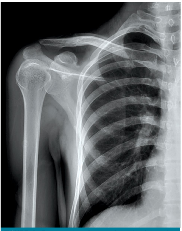
FIGURE 3. Postoperative direct radiograph of a patient treated with all-suture anchors.

patient and a direct collision when playing football in the Group B patient. Open Latarjet reconstruction was performed on both patients. Apprehension test positivity was determined in two patients in Group A and in three patients in Group B (Table II). According to the Samilson-Prieto classification, there was no evidence of glenohumeral osteoarthritis in any of the patients in either group (Figure 3). There was no statistically significant correlation between the patient age at operation and age at first dislocation and the clinical scores. A high correlation was identified between the Rowe score and the Constant score (r=0.91; p=0.0001).