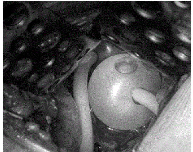
Fig. 3. Gross active bleeding would be stopped by balloon compression.