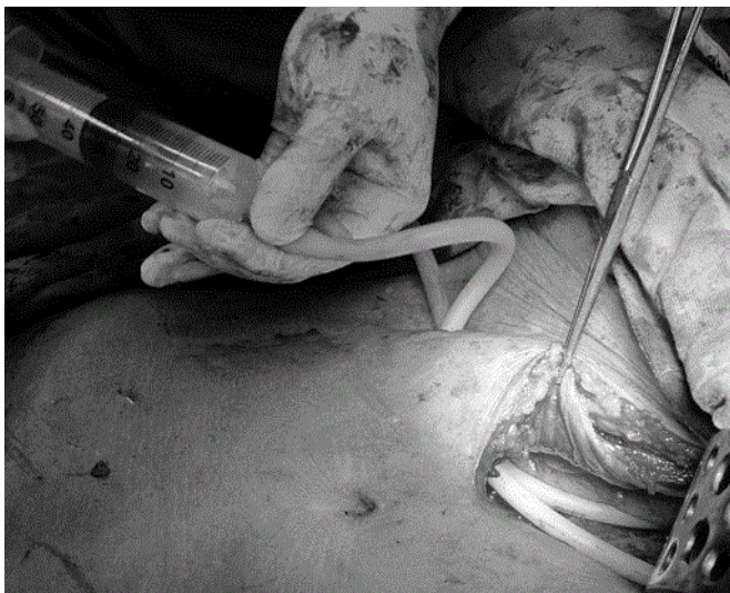
Fig. 2. Each balloon was inflated with 40 mL of sterile water to keep the catheter from falling out of the pelvis.