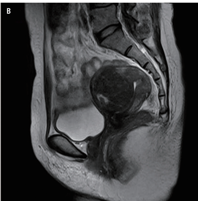
Fig. 2. (A) T2-weighted magnetic resonance image of 5.5-cm-sized submucosal myoma before high-intensity focused ultrasound. (B) 6.1-cm-sized myoma with focal degeneration after ten months of high-intensity focused ultrasound.

went one time of US-guided HIFU ablation at another hospital in May 2011.