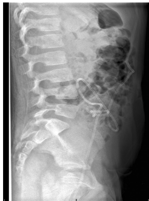
Fig. 2 X-ray lateral decubitus position showing the loop in the right side of the abdomen.

For high-risk or documented infections, the timing of shunt replacement is variable. Treatment time is often guided by cultures of cerebrospinal fluid, which should be negative for several days before the shunt revision is planned. 26 Of the documented pediatric cases, one had the shunt revised in the same session but was given prophylactic antibiotics for 1 week. 8 Another case also had only one surgical intervention with no shunt revision required because the distal shunt was never extruded but rather was stuck in the fallopian tube. 13 In seven of the nine cases that reported follow-up, replacement of the shunt or endoscopic third ventriculostomy was required later after a course of antibiotics. Upon replacement, a new distal site other than