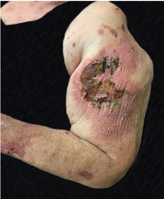
Figure 2 Paracoccidioidomycosis: extensive ulcerative necrotic lesion, areas covered by crusts and with an intense inflammatory halo. Papules and satellite plaques, located on the left arm and forearm.

hypothesis was primary cutaneous cryptococcosis, due to the inflammatory aspect associated with necrosis, localized in exposed areas; however, the bilateral aspect of the lesions did not correspond to this hypothesis. Biopsies and laboratory investigation were performed; the final diagnosis of paracoccidioidomycosis was surprising and confirmed by histopathological examination (Figs. 3 and 4) and direct mycological examination. Complementary tests, including chest and abdominal computed tomography (CT), ruled out involvement of other organs. Laboratory tests revealed elevated CRP and glycemia, negative HIV and anti- P. brasiliensis serology, and negative culture for bacteria and fungi. The clinical response was complete after treatment with itraconazole 400 mg/day in the first month, decreased to 200 mg/day until the sixth month of treatment.