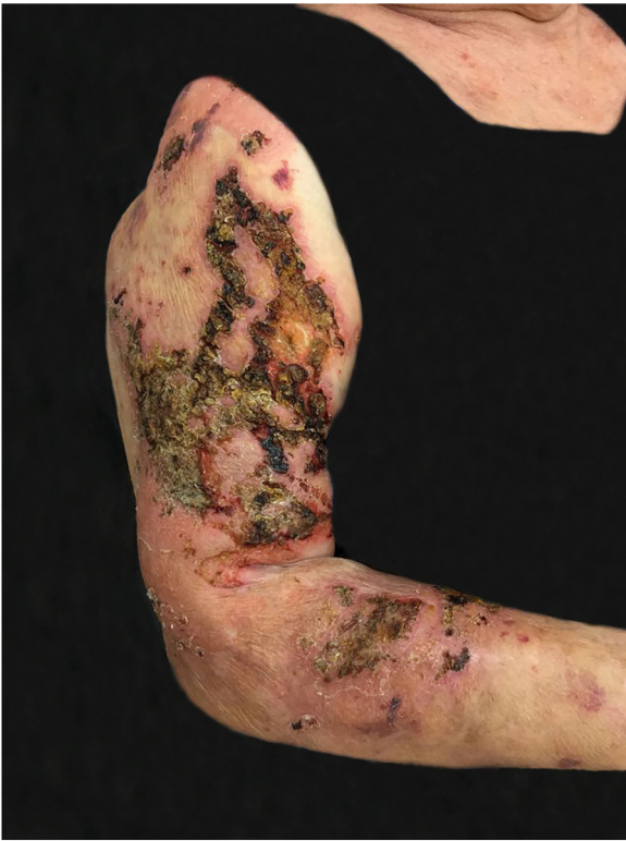
Figure 1 Paracoccidioidomycosis: ulcerative-necrotic, phagedenic lesions, with areas covered by crusts, affecting the right arm and forearm.