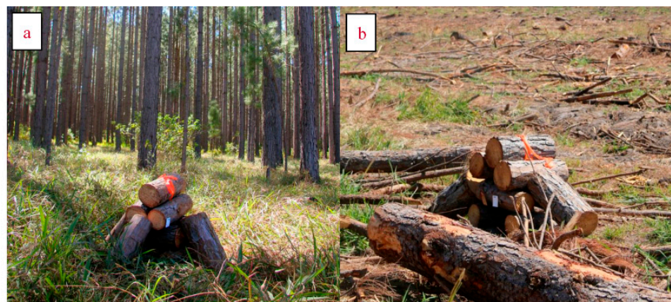
Figure 1. Set up of the local substrate availability in the unharvested (a) and harvested (b) pine plantation.