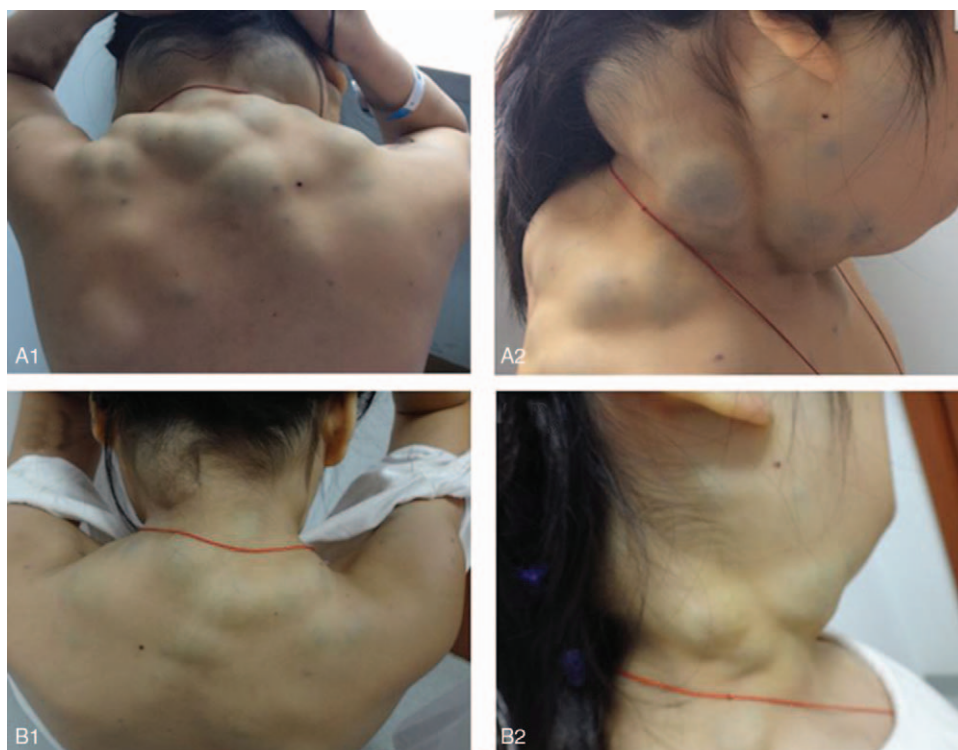
Figure 1. Blue rubber bleb on the back and side of the neck before and after sirolimus treatment. Blue rubber bleb on the back of the neck before treatment (A1) and after treatment (B1). Blue rubber bleb on the side of the neck before treatment (A2) and after treatment (B2).

The laboratory findings demonstrated severe anemia ( 1.63 \times 10^{12}/L red blood cell and 28 g/L hemoglobin, Fig. 2) characterized by small cells and low pigment (mean corpuscular volume 17.2 pg, mean corpuscular hemoglobin concentration 252 g/L, and serum iron 1.4 \mu\text{mol}/L ). The white blood cell count was 3.0 \times 10^9/L and the platelet count was 119 \times 10^9/L . The fecal occult blood test was positive. Liver function, renal function, and myocardial enzyme were nearly normal. Ultrasound revealed that the bilateral internal jugular vein was normal. The muscle tissue and subcutaneous facial and neck tissue confirmed multiple heterogeneous key vocal ranges, attributable to potential hemangioma. The lower limb venous ultrasound examination did not see any obvious anomalies. A multiple heterogeneous low echo area was found in the muscular rear of the left leg, with respect to hemangioma. In addition, the abdominal echography revealed multiple heterogeneous low echoes in liver, pancreas,