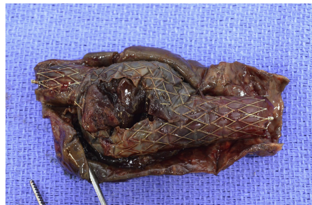
Figure 2. Explant macroscopic evaluation at reception. External encapsulation of the device into the aneurysmal sac and disruption of membrane and stent.

It is however important to distinguish atherosclerotic lesions from aneurysmal lesions. Nitinol flexible characteristics have been shown to be useful in locations crossing a joint, and it has now been demonstrated that stent graft deformation as the result of undue stress on the iliofemoral junction during movements of the hip should no longer be feared in the setting of atherosclerotic lesions. 4–6 In this report, systematic analysis of the stent graft revealed that membrane perforation was located at the level of an angle formed by the struts. It might be suggested that hip flexion was responsible for textile erosion, as the bend in the struts itself could have perforated the membrane, and also because the stitches may have been frayed from repeat flexion. One could also assume that the behaviour of the stent graft might be different in an aneurysmal than in an atherosclerotic location. In an aneurysmal artery, the central part of the stent graft is free, while the proximal and