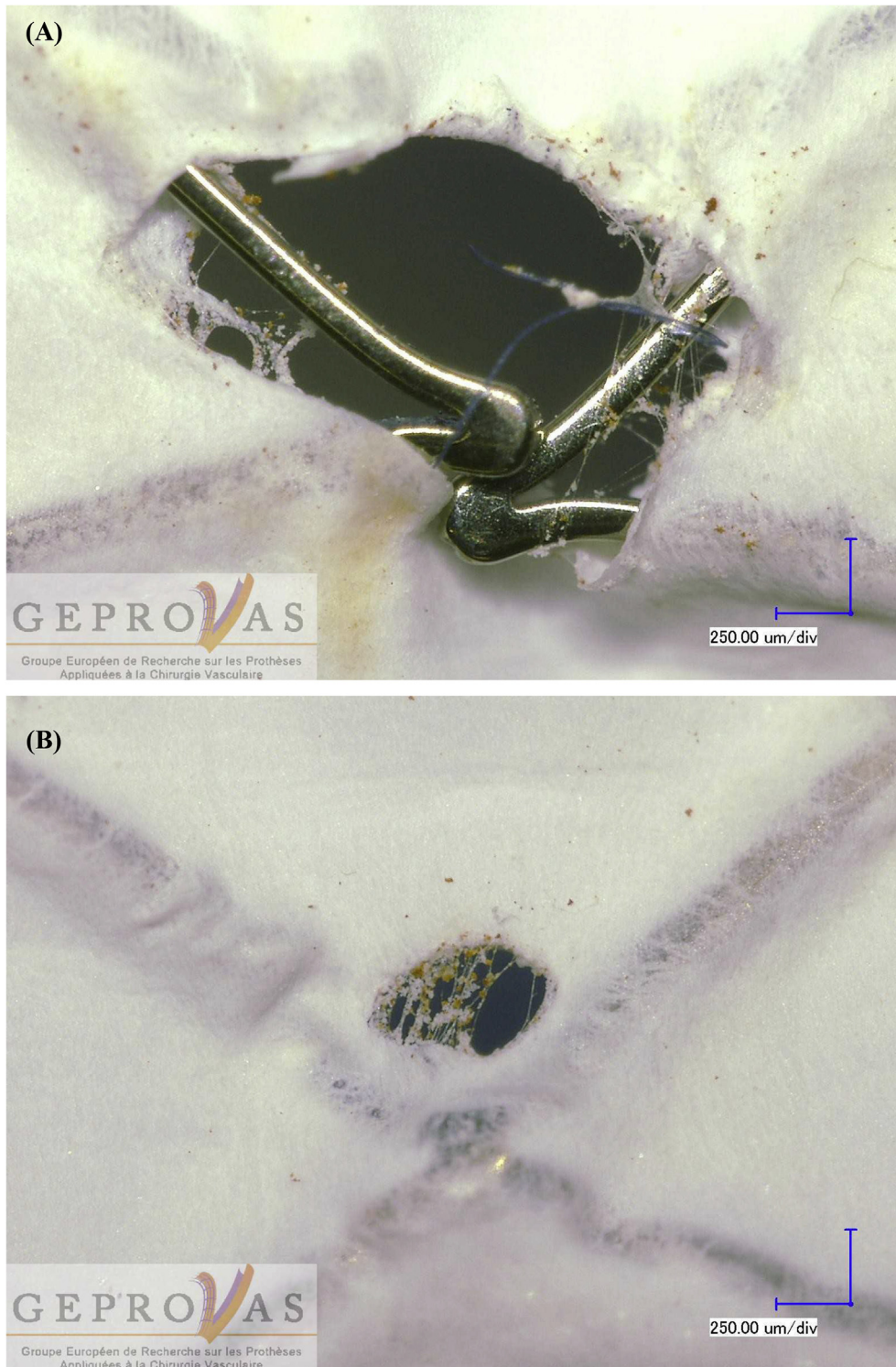
Figure 4. Microscopic evaluation ( \times 100 ) Keyence® VHX-600. Stent protrusion at the level of membrane perforation (A); membrane degradation (B).

continued high radiation surveillance. Standard radiographs might have shown stent graft fracture detail much better than CTA, and this could have depicted covered stent graft disruption earlier.