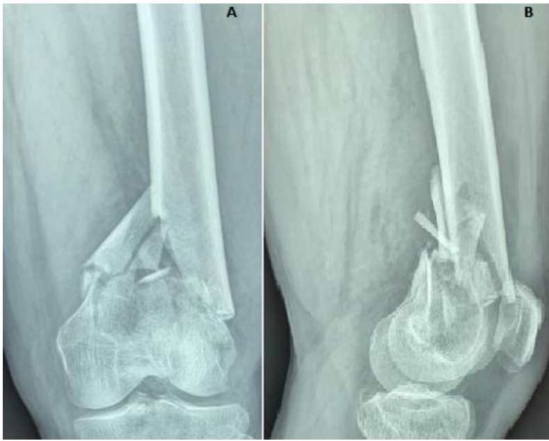
Figure 3: anteroposterior (A) and lateral (B) radiographs of a C2 type distal femoral fracture