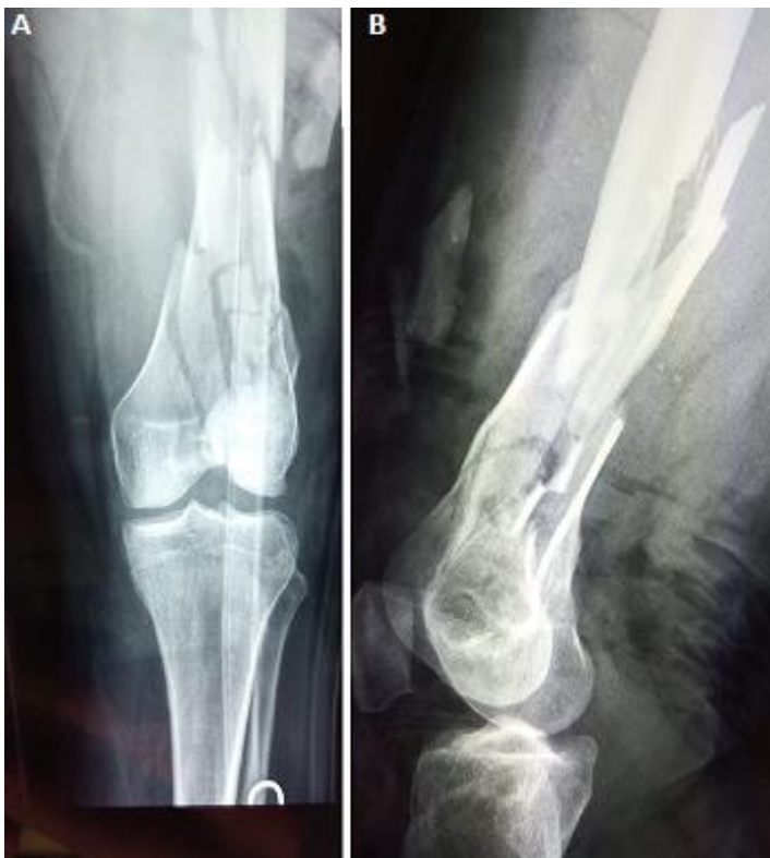
Figure 4: distal femoral fracture type C3: anteroposterior (A) and lateral (B) views of the knee