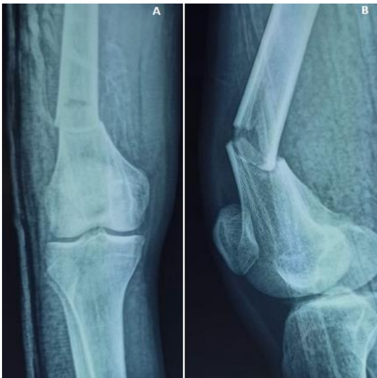
Figure 2: preoperative radiographs of the knee: anteroposterior (A) and lateral view (B); the images show distal femur fracture (A1 according to AO/OTA classification)