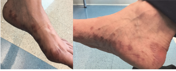
FIGURE 1: Photograph of lichen planus lesions on the patient's feet.