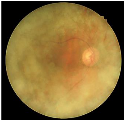
Fig. 1. Right eye at presentation with hazy media and glass-wool-like appearance.