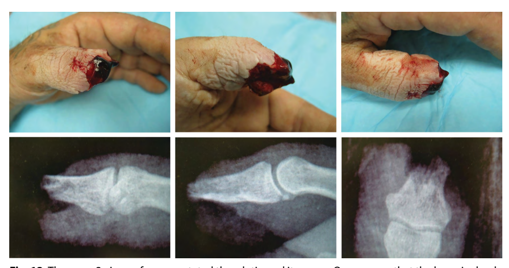
Fig. 13. These are 3 views of an amputated thumb tip and its x-rays. One can see that the bone is clearly exposed. However, the fat, skin, blood vessels, and nerves were gradually pulled over the exposed bone over 6 weeks with wound contracture. Every day, the wound was showered and covered with Vaseline and Coban tape so the raw wound did not dry and die.

Smoking makes arteries smaller and smaller over the years and eventually shuts off the blood supply to legs and feet. As a matter of fact, 1 cigarette decreases peripheral