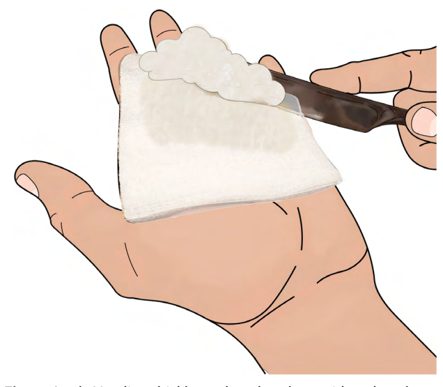
Fig. 4. Apply Vaseline thickly to clean bandage with a clean butter knife (everything does not need to be sterile, just clean).

they are allowed to dry. Tissues are drying, tissues are crying (they hurt, and the patient feels pain), tissues are dying.