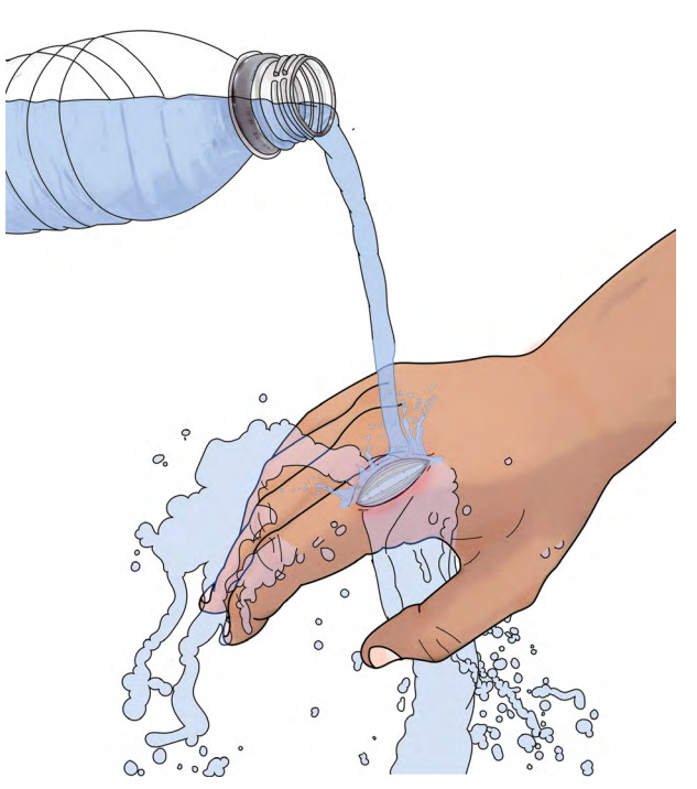
Fig. 3. Rinse the wound with bottled water if the shower water is not clean water.

The main rule for raw wounds is that we cannot let the tissues dry and die. Once we lose the waterproof barrier of the skin, the underlying tissues will die if