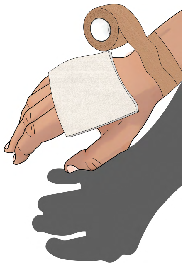
Fig. 5. Cover wound with clean greased bandage so the wound does not dry and die.

barriers work just as well in most cases. After washing our hands (gloves are not necessary), and after the wound has been rinsed with clean shower or bottled water, we apply a clean bandage onto which we smear a thick layer of clean Vaseline (see Video 2 [online]). The grease provides a barrier to keep the water in the raw wound, so it does not dry and die. The Vaseline does not need to be sterile, but it should be clean. It can be spread onto the bandage thickly with a clean butter knife before covering the wound with the clean bandage. The bandage does not need to be sterile.