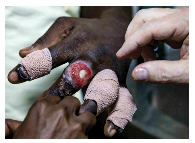
Fig. 11. The same treatment was applied to all 4 fingers daily after the shower and bottled water rinse.