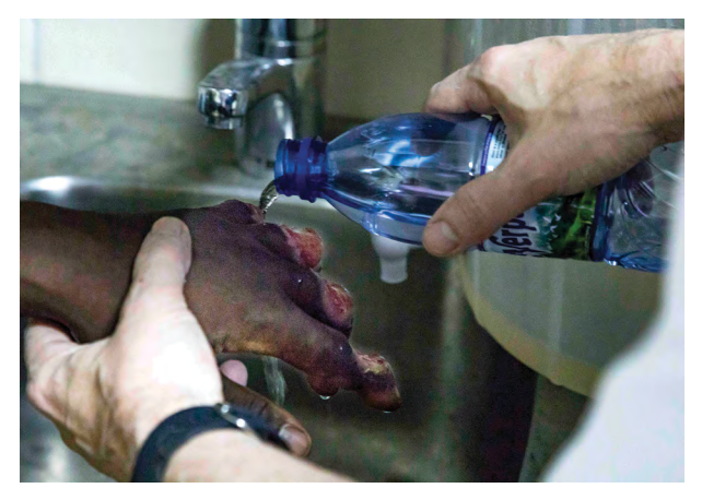
Fig. 8. He rinsed the wound daily in the shower followed by bottled drinking water rinse.