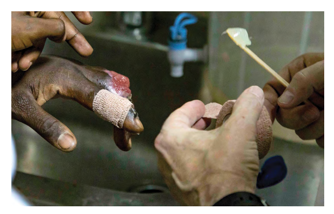
Fig. 9. He applied Vaseline directly to Coban tape after cleaning the wound daily.