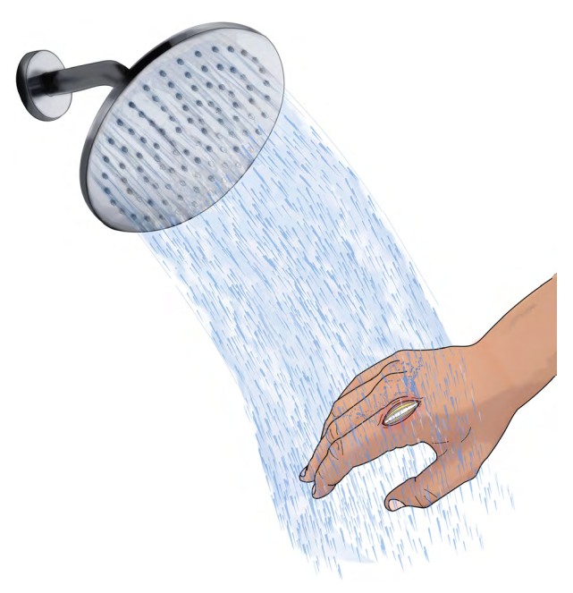
Fig. 2. Daily shower water to rinse the wound.