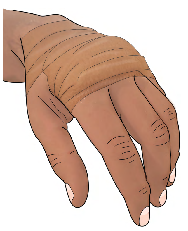
Fig. 6. Keep the bandage secure with tape, such as Coban, so the wound stays covered with grease.

Dressings do not need to be sterile, just clean. Sterile dressings are expensive and unnecessary. Coban tape off the roll is a good clean dressing that can be directly applied over grease on fingers and leg wounds. Panty liners, sanitary napkins, and diapers out of the package are another good source of clean inexpensive dressings. Every day, the old dressing is removed and the patient gets in the shower to let clean water run over the wound. After the shower, grease is applied thickly to a clean bandage.