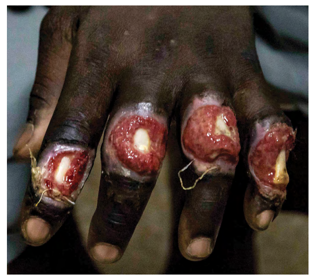
Fig. 7. Exposed bone in 4 fingers in a patient in Ghana in 2017.

That is placed on the wound to pad it, protect it, and keep it moist until tomorrow (Figs 13 and 14).