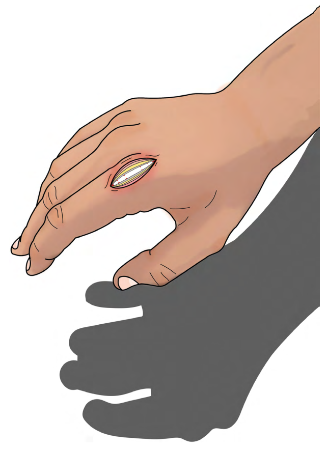
Fig. 1. Raw wound with exposed bone, joint, and tendon.