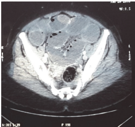
FIGURE 2: Axial view of computed tomography (CT) of the abdomen showing grossly dilated, thick-walled small bowel loops up to the region of the pelvis.

Patient was resuscitated and optimized for surgery. Exploratory laparotomy revealed dilated small bowel loop with a compressible obstructing mass (transition zone) at 50 cm from the ileocecal junction. The small bowel loop bowel distal to the transition zone was collapsed (Figure 3). Enterotomy of the transition zone revealed an 8 cm by 6 cm egg-shaped accretion of vegetable matter (Figure 3). Enterotomy was closed after removal of the phytobezoar. Postoperative period was uneventful. She was discharged home 5 days after surgery and was subsequently followed up at regular intervals as an outpatient.