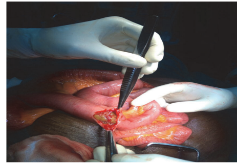
FIGURE 3: Obstructing distal ileal phytobezoar seen at laparotomy.

Mechanical intestinal obstruction in the elderly is a common presentation and indication for surgical intervention