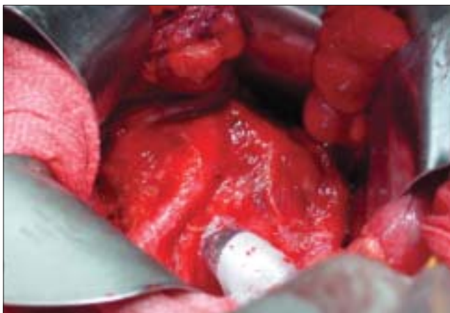
Figure 2: A handy type gamma probe is used to detect SNs ( in-vivo probing)

Hitherto it has been widely recognized that neoadjuvant hormone therapy (NHT) decreases the accuracy of the pathologic diagnosis of RPx specimens. Here we introduce the results obtained from our SN research based on extended dissection and investigation of micrometastases that suggest that NHT similarly interferes with the accuracy of the diagnosis of LN metastases. Extended dissection and LN mapping were conducted in 42 patients with prostate cancer (mean age 67.8 years, mean PSA 25.1 ng/ml) without clinically evident metastases. The mean number of resected LN was 26.3. In the group in which NHT was not administered (n = 15), four cases were diagnosed as metastasis positive by pathologic examination of routinely H and E-stained largest cut sections of resected LN, with this number not increasing when micrometastasis diagnosis