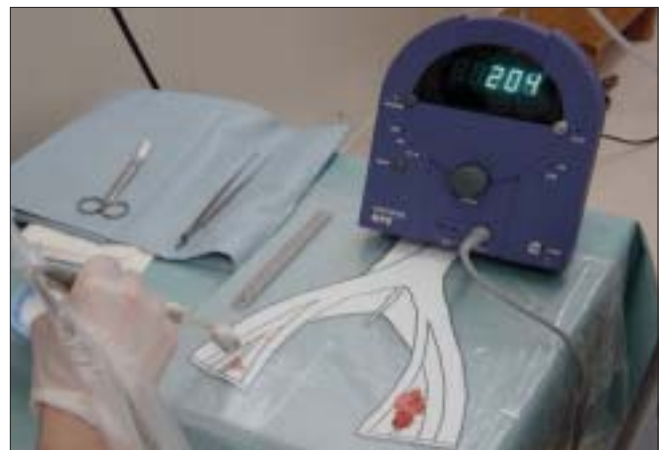
Figure 3: On a back table the LNs are mapped separately, and the SN more accurately identified ( ex-vivo probing)