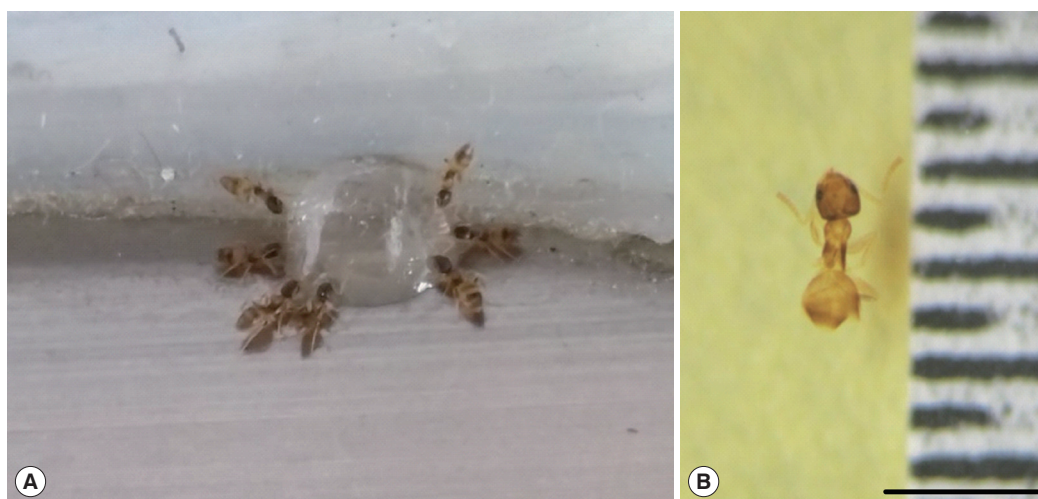
Fig. 1. Ghost ant ( Tapinoma melanocephalum ) workers. (A) T. melanocephalum at a bait trap with 10% sugar solution. (B) Dorsal view. Scale bar = 1 mm.

and the appendages, petiole, and gaster being milky white. The eyes were large, the antennae had 12 segments, the thorax was spineless, the gaster was hairless, and the abdomen had no stinger (Fig. 1B).