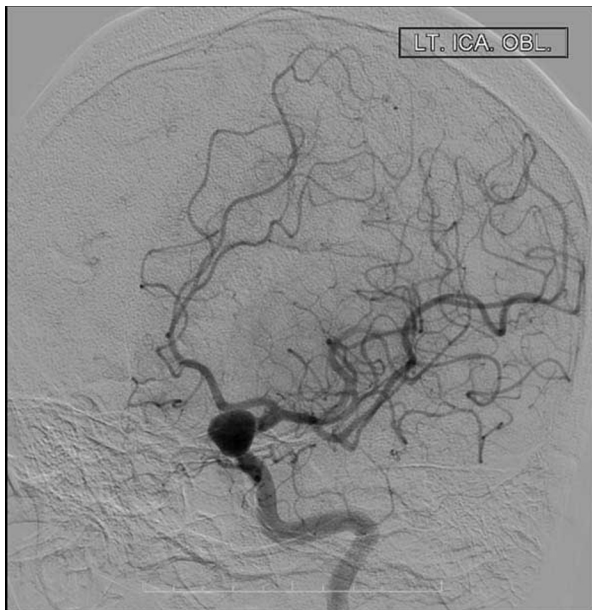
Figure 2. 37-year-old female with an unruptured superior hypophyseal aneurysm. One-vessel cerebral DSA. Left superior hypophyseal aneurysm projecting medially with normal cervical, petrous, cavernous portion of the internal carotid artery.

measured approximately 12x11x12mm; the largest neck diameter was 6mm. This was followed by placement of multiple GDC coils, until complete obliteration of the an-