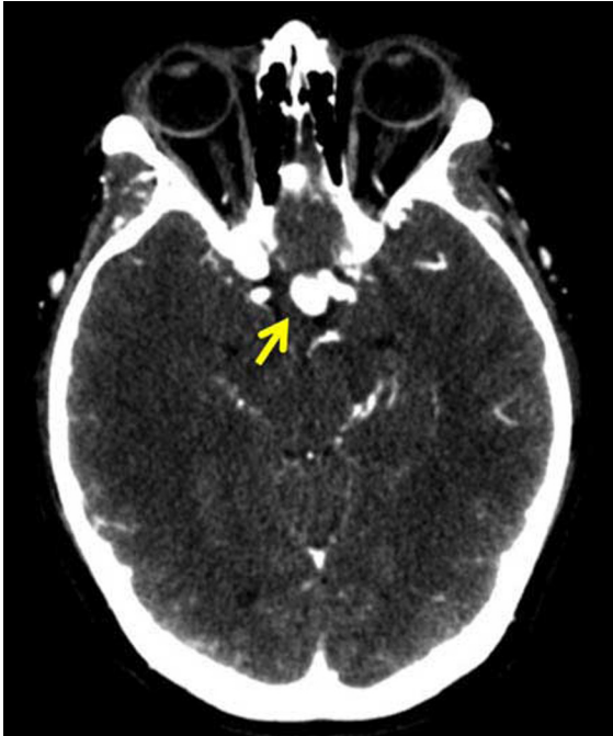
Figure 1. 37-year-old female with an unruptured superior hypophyseal aneurysm. Contrast-enhanced CT showing axial images of the head. A hyperdense region is visualized at the level of the suprasellar cistern (yellow arrow) consistent with an intracerebral aneurysm.