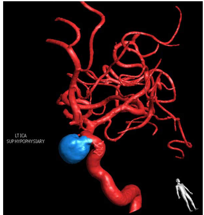
Figure 3. 37-year-old female with an unruptured superior hypophyseal aneurysm. DSA with 3D rotational reconstruction of the left ICA. The blue sacular projection corresponds to a left superior hypophyseal aneurysm.

measured approximately 12x11x12mm; the largest neck diameter was 6mm. This was followed by placement of multiple GDC coils, until complete obliteration of the an-