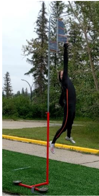
Figure 3. Photograph of a participant performing the maximum jump test.

Lastly, participants performed a maximum effort 10 m sprint acceleration. Athletes started in a stationary, self-selected stance at the starting line, accelerated forward while breaking the starting line timing gates and sprinted 10 m through the finish line timing gates (Figure 4). Sprint acceleration performance was determined as the time to sprint 10 m.