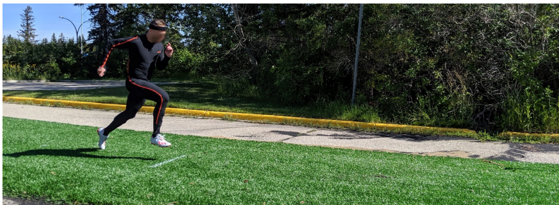
Figure 4. Photograph of a participant performing the 10 m sprint acceleration.

Lastly, participants performed a maximum effort 10 m sprint acceleration. Athletes started in a stationary, self-selected stance at the starting line, accelerated forward while breaking the starting line timing gates and sprinted 10 m through the finish line timing gates (Figure 4). Sprint acceleration performance was determined as the time to sprint 10 m.