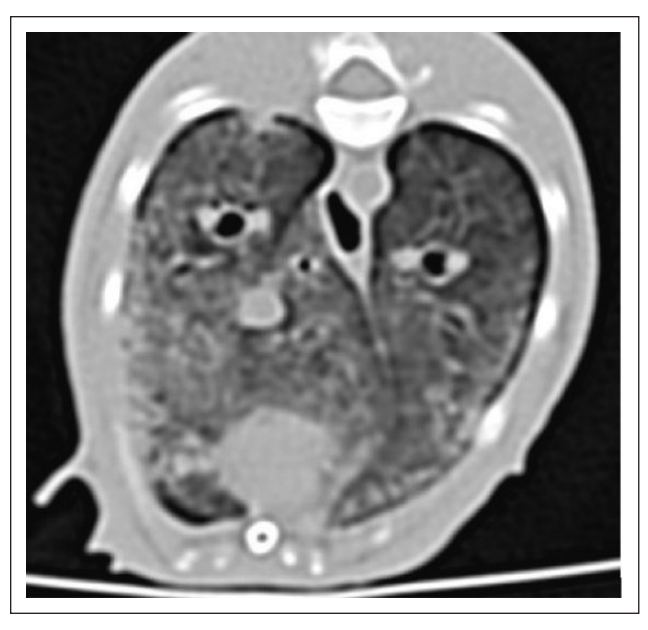
Figure 2 CT image of the thorax of a hypercalcaemic cat (case 1) revealed diffuse interstitial hyperattenuation of the pulmonary parenchyma

The cat re-presented on day 7 and was reported to be brighter with reduced but persistent coughing and retching and resolution of vomiting and melaena. Serum