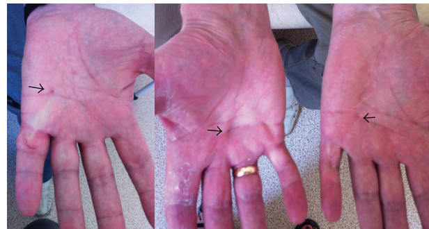
FIGURE 2: Hands of Probands III-2 and III-3. Arrows indicate contracture site. Distal muscle atrophy of hands.

III-8 Cousin had myopathy and proximal muscle weakness, but he is still ambulatory.