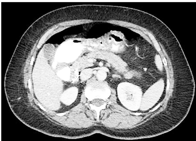
► Fig. 2 Abdominal CT scan performed 24 hours after a duodenal bulb perforation treated by OTSC placement. The clip is in the same location and the opacification with oral contrast shows no leakage.

foration without leakage. The overall clinical success rate was 81.8% (9/11). Indeed, 2 patients had to undergo surgery despite adequate closure of the perforation. The first one (Case 1) had a perforation at the rectosigmoid junction during retroflexion in the rectum. A complete seal of the perforation was obtained with a single OTSC but in the following hours, the patient had abdominal pain with localized guarding in the left lower quadrant; thus, he underwent exploratory laparoscopy, which showed no leakage after injection of methylene blue. However, there was a purulent effusion in the peritoneal cavity and a sigmoid colostomy was performed. The clinical outcome was favorable after surgery. The second patient (Case 6) also had a perforation at the rectosigmoid during diagnostic colonoscopy. The perforation was managed by placement of an OTSC and exsufflation of the pneumoperitoneum using an 18-gauge needle was performed during the procedure. A computed tomography (CT) scan 24 hours later showed a pneumoperitoneum and complete sealing of the perforation. However, the right urinary tract was dilated above the clip suggesting that the clip might have captured the right ureter. Another CT