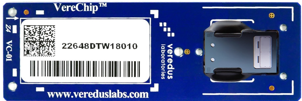
Fig 1. VereChip.

https://doi.org/10.1371/journal.pone.0228312.g001