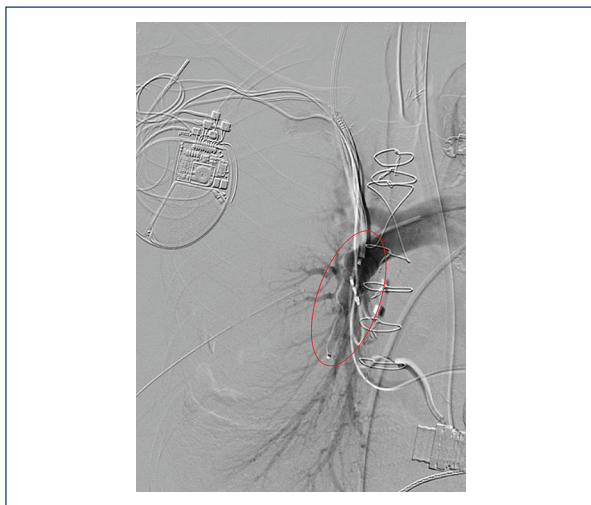
Figure 2. Post-procedural fluoroscopy. An 18-mm Amplatzer device was deployed in the right inferior pulmonary artery successfully decreasing distal flow and halting extravasation of blood.

devices, to achieve bleeding-source control in patients with LVADs.