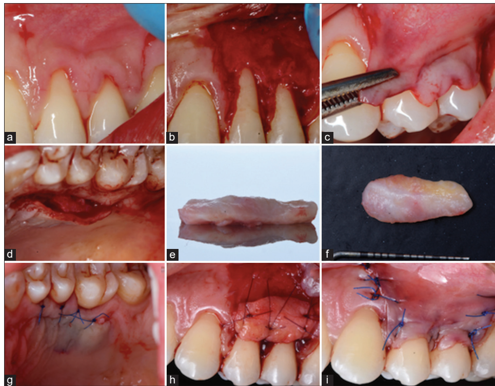
Figure 2: Overview of CAF + SCTG procedure: (a) Trapezoidal flap, (b) papillae de-epithelialization, (c) flap advancement, (d) single line incision and SCTG, (e) SCTG after being harvested, (f) SCTG, (g) suturing of donor site, (h) SCTG sutured, (i) suturing of flap. CAF: Coronally advanced flap, SCTG: Subepithelial connective tissue graft

instructed to gently brush the operated area with a soft tooth brush using roll technique. [6]