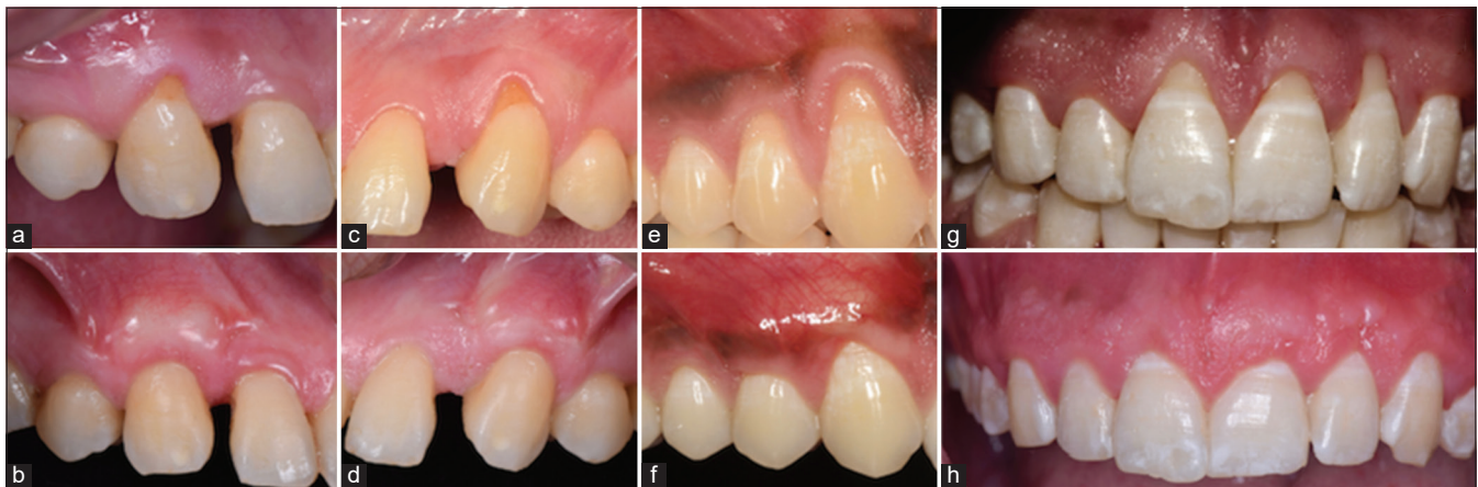
Figure 4: Preoperative and 6 months postoperative clinical photographs: (a) 2 mm recession at the maxillary right canine, (b) CAF + SCTG showing CRC after 6 months, (c) 2 mm recession at maxillary left canine, (d) CAF + SCTG showing CRC after 6 months, (e) 3 mm recession at the maxillary right canine, 2 mm at the maxillary right first premolar (f) CAF + DFGG showing CRC after 6 months, (g) recession at maxillary right central (2 mm), maxillary left central (2 mm) and left lateral (3 mm) (h) CAF + DFGG showing CRC after 6 months. CAF: Coronally advanced flap, DFGG: De-epithelialized free gingival graft, SCTG: Subepithelial connective tissue graft, CRC: Colorectal cancer

and 0 (0–9) for DFGG and SCTG, respectively, with no significant difference ( P = 0.959 ) between them. Both groups showed a significant decrease ( P = 0.001 ) in pain-related VAS values after 7 days compared to 3 days postsurgically. The VAS median (range) values of postoperative stress were 5 (3–8) and 0 (0–10) and for inability to chew were 4 (2–9) and 1 (0–9) after 2 weeks for DFGG and SCTG, respectively, with a significant