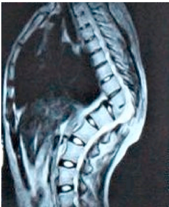
Fig. 4. X ray showing tuberculous of thoracic spine.

of skeletal tuberculosis cases is in students (58, 19%) and laborers (47, 15.4%)