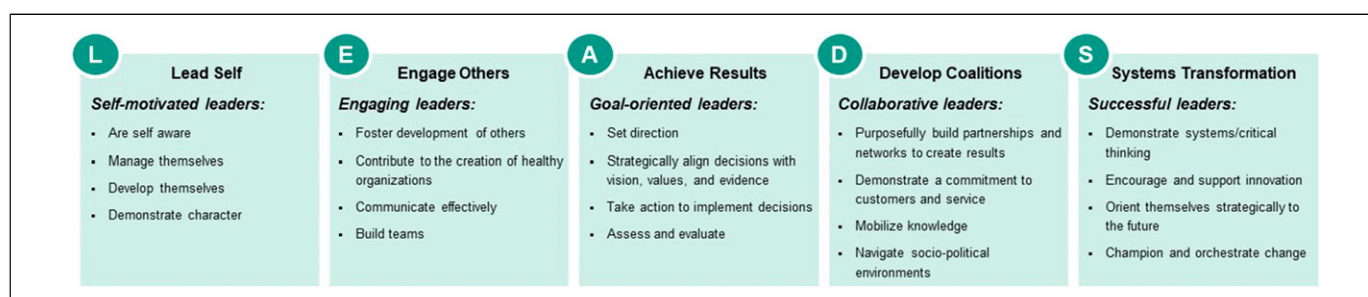
Figure 1. Overview of the LEADS in a caring environment framework.

Taken as a whole, most leadership frameworks, 11-15 including the LEADS framework, align on five competencies: (i) uphold justice, fairness, and ethical standards; (ii) exhibit and support flexibility, open-mindedness, and ability to manage change; (iii) enable and uplift talent; (iv) develop and model a high standard of excellence; and (v) demonstrate accountability for results. Each of these competencies is indispensable to healthcare and research leadership—and each can be strengthened and improved when infused with the principles of IDEA. Indeed, CCHL has developed equity, diversity, and inclusion (EDI) toolkits outlining promising EDI practices mapped to each of the four pillars of the LEADS framework. 17 While leaders must explore opportunities to lead in a way that represents and reflects the cultures of the communities