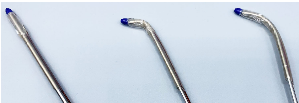
FIGURE 1 Sinusleeve balloon sinus dilation device loaded over (from left to right) straight, short curved and long curved suctions.

For the selected dissections in which the balloon was utilized, the operating surgeons found that: utilizing the balloon could increase working room within the posterior ethmoid (Figure 2), sphenoid ostium (Figure 3) and frontal recess (Figure 4) which facilitated further natural pathway surgery. Furthermore, surgeons rated the device as especially helpful in cases in which inflammation led to increased mucosal bleeding during sharp dissection. In these situations, BSD allowed for continued surgical progress with minimal further bleeding while creating a larger well for subsequent blood loss leading to an