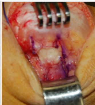
Figure 3: Intraoperative photograph showing the dissection of the hypertrophic medial patellofemoral ligament.