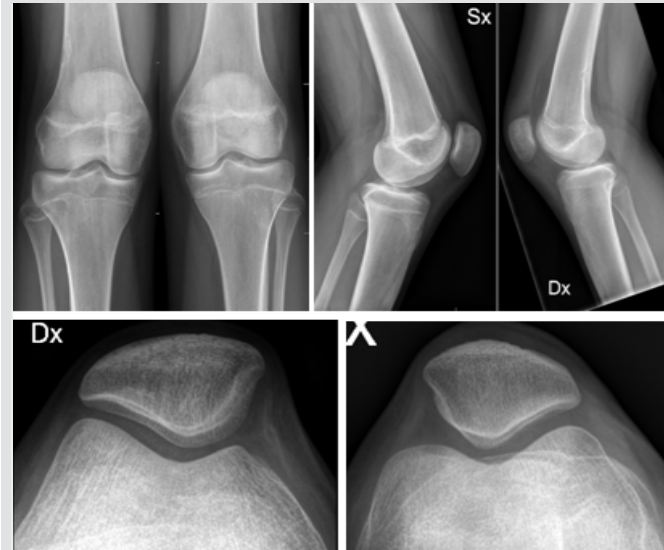
Figure 2: Pre-operative radiographs of both knees.