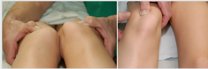
Figure 1: Pre-operative clinical evaluation showing the abnormal medial patellar laxity.