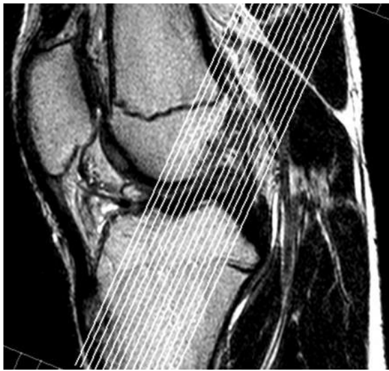
FIGURE 1. Sagittal image of standard MRI examination as a topogram for planning the paracoronal oblique T2 FSE 2 mm image.