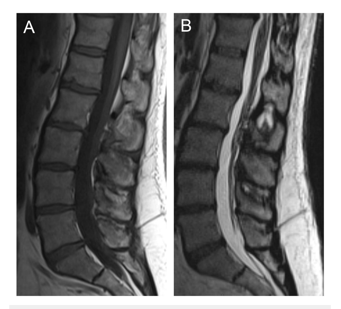
FIGURE 2: Radiographic findings on MRI

fluoroscopic guidance with marked symptomatic relief.