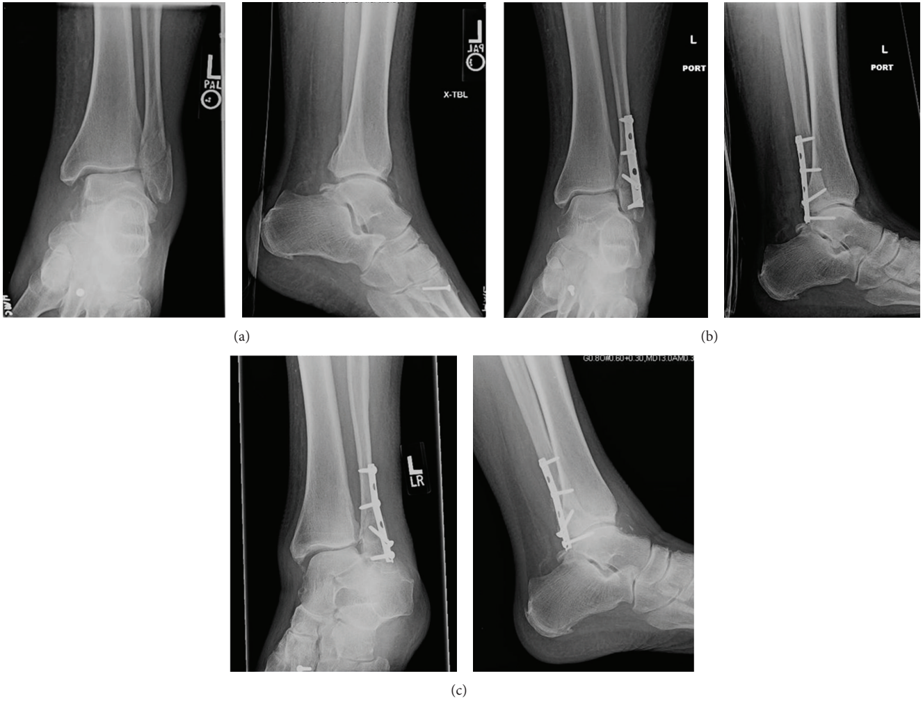
FIGURE 2: Single case of loss of reduction, suspect secondary to missed syndesmotic injury. (a) Preoperative mortise and lateral radiographs. (b) Immediate postoperative mortise and lateral radiographs. (c) 6 weeks of followup mortise and lateral radiographs.