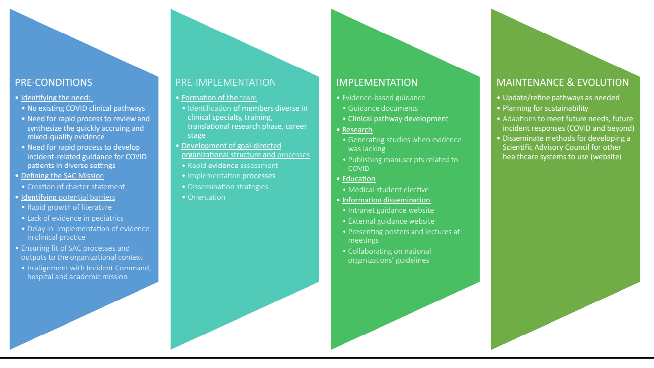
Figure 1. Application of each phase for development and implementation of CCREADS.