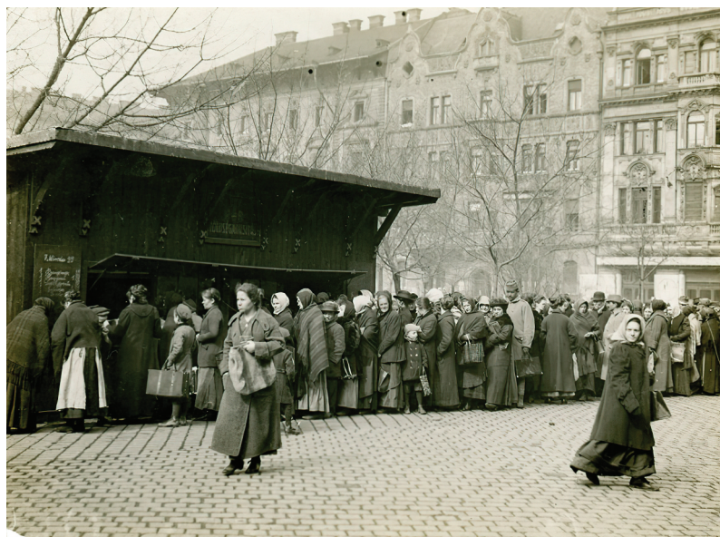
Figure 1. People queuing for potatoes in front of the Market Hall in Rákóczi square in Budapest in 1915.

In describing the places peasants exchanged ideas, Marin has emphasised locations like the village pub, the railways, gatherings on occasions when literate persons read and interpreted the newspapers to peasants, as well as the figure of the peddler who moved from village to village selling household items to peasants. She has not addressed, however, the gendered division of these spaces and the possible effects this gendering could have on men and women's participation in spreading rumours. Scholarship on