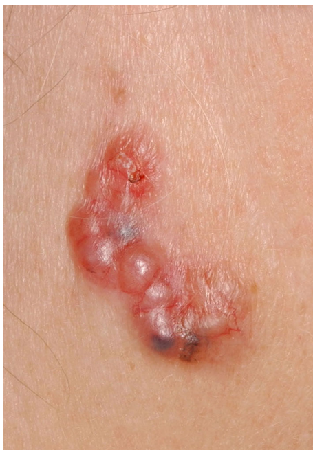
Fig. 2 Clinical findings upon first presentation in 2010: an earlier tumor in the right retroauricular area showed the typical appearance of BCC with multiple skin-colored nodules arranged as beads with aberrant vascularization