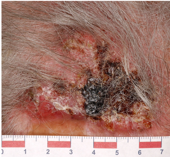
Fig. 1 Clinical findings upon first presentation in 2010: large ulcerated basal-cell carcinomas in the right frontal and parietal area. A tumor relapse was suspected as a prior skin graft on her forehead was affected