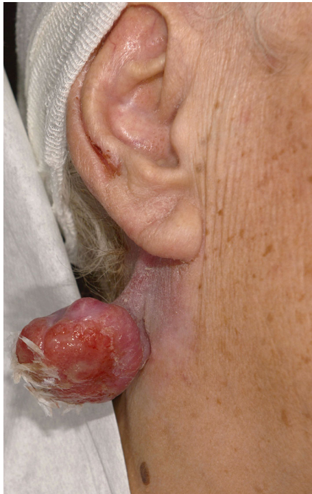
Fig. 4 Clinical findings upon second presentation in 2019: the tumor in the right retroauricular area had grown extensively in an unusual pedunculated manner leading to fibrosis of the base

option for singular extensive lesions. Common modalities with similar efficacy include interstitial brachytherapy, contact therapy and conventional fractionated radiotherapy [13]. Radiation therapy should also be considered for adjuvant treatment of high-risk BCCs with perineural involvement and if tumor-free margins are not reached by surgery of justifiable extent [8]. It remains a hallmark therapy option, especially in elderly patients with a limited life expectancy who require reliable disease control. BCCs patients may have soaring numbers of tumors following radiotherapy and ionizing radiation because of accumulation of new mutations. Therefore, it should be avoided in these patients, although some authors consider it safe at least for adult patients [14]. Other contraindications include connective tissue diseases (e.g., lupus erythematosus) as they carry an increased risk of acute toxicity [9]. Radiation of tumors close to radiosensitive