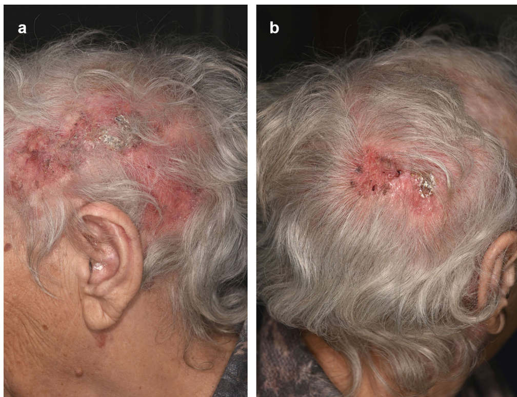
Fig. 5 Clinical findings upon targeted therapy with SMO inhibitors for 3 months: impressive partial remission of all tumors

drugs. On the other hand, renal and hepatic organ dysfunction is no criterion for exclusion; regular laboratory controls are advisable.