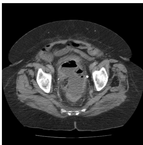
Figure 1 Computed tomography scan of the abdomen and pelvis (axial section) demonstrating the diverticular abscess extending anterior to rectum.

The patient was taken to theater after adequate resuscitation with intravenous fluids and intravenous antibiotics (piperacillin and tazobactam 4.5 gm and metronidazole 500 mg three times a day). She was placed in the lithotomy position under general anesthetic and a per-rectal examination was performed. The abscess was abutting the anterior wall of the mid rectum on digital examination. A 22G epidural needle attached to a 10 mL syringe was inserted into the pelvic abscess through the rectum.