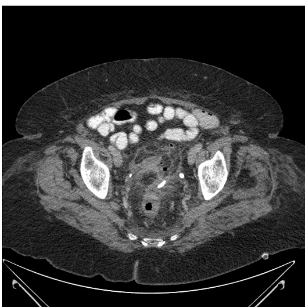
Figure 2 Computed tomography scan of the abdomen and pelvis (axial section) after drainage of the abscess with catheter in-situ .