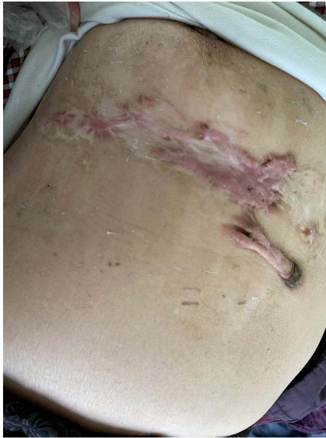
Figure 3 Hypertrophic Keloid in intercostal region.