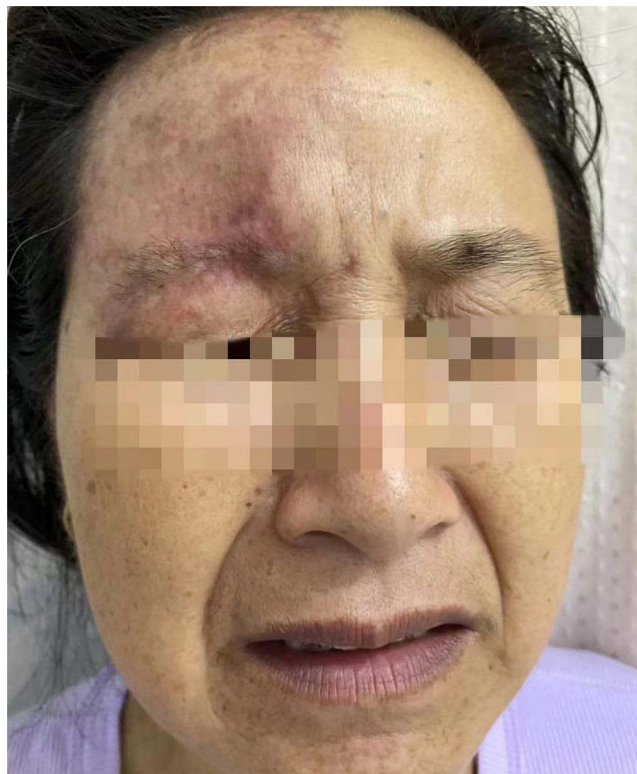
Figure 1 Erythema and pigmentation in the trigeminal nerve region.

There were 44 cases with skin lesions, 7 cases of whom were infected in the trigeminal nerve area, 23 cases in the intercostal nerve area, 7 cases in the brachial plexus area, and 7 cases in the sacrococcygeal plexus area. There were 19 cases with erythema pigmentation, among whom, 3 cases were infected in the trigeminal nerve area (see Figure 1 ), 9 cases in the intercostal nerve area, 5 cases in the cervical brachial plexus area, and 2 cases in the sacrococcygeal plexus area. There were 11 cases with hypopigmentation (see Figure 2 ), among whom 2 cases were infected in the trigeminal nerve region, 6 cases in the intercostal nerve region, 1 case in the cervical brachial plexus region, and 2 cases in the sacrococcygeal plexus region. There were 4 cases were with hypertrophic scars (see Figure 3 ), among whom 2 cases had scarring in the intercostal nerve area, 1 case had scarring in the cervical brachial plexus region, and 1 case had scarring in