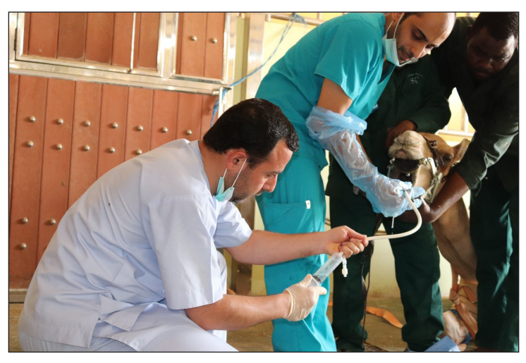
Fig. 1. BALF collection procedure using BALF catheter from dromedary camel.