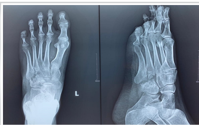
Figure 4: 14 months follow-up radiograph of the left foot showing resolution of the infection and consolidation of the lesion in the cuboid.