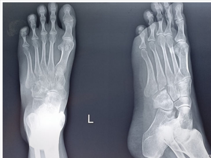
Figure 1: Plain radiograph of the left foot showing osteolytic lesion over the base of 3rd, 4th, and 5th metatarsals, middle and lateral cuneiforms and cuboid bones along with soft tissue swelling and diffuse transient osteopenia.