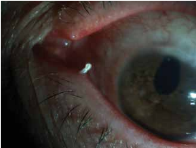
Figure 2. A patient with canaliculitis due to an eyelash entering the left inferior canaliculus